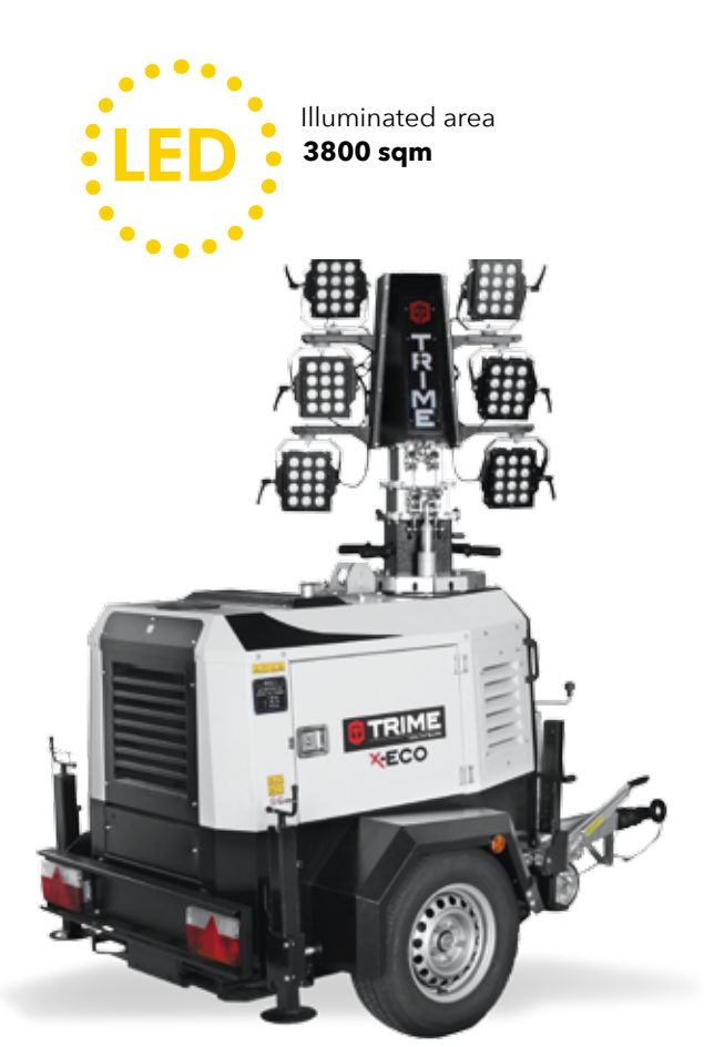
Ease of transport and handling